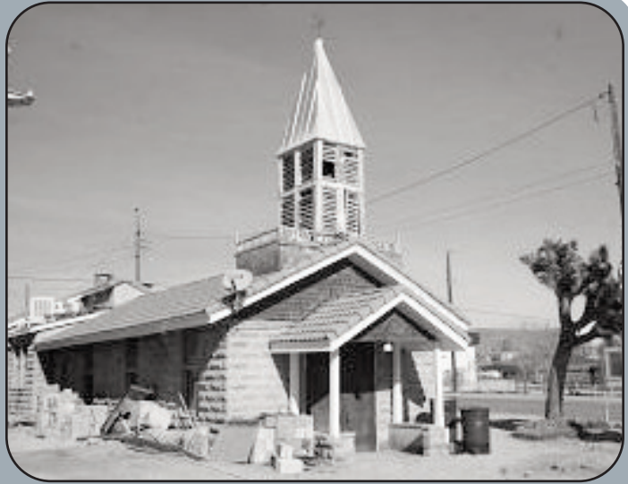
VFW Post in Beatty, Nevada

The course is 41 miles long, consisting of mostly class two and three roads featuring the history, pre-history, and geology of the Bullfrog Historical Mining District. The course was designed for 4X4 vehicles and UTV's. Sorry but no dirt bikes