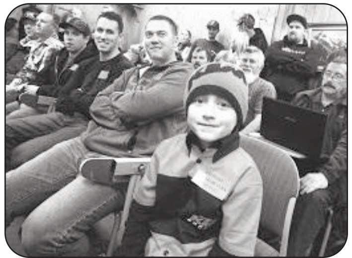
Livermore City Council Meeting

Your Northern Board of Directors of CORVA was there in force, supporting all those who came by handing out orange