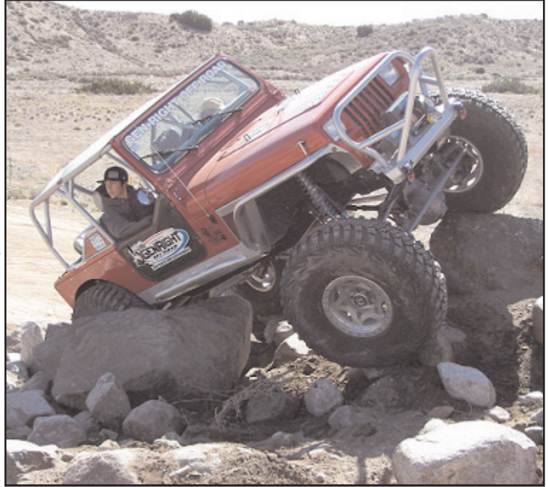
Attendees having a blast at last year's Family Fun Run

TICKETS: Available for purchase online and at the box office. (Visit: http://www.venturacountyoffroadshow.com/ for more information.)