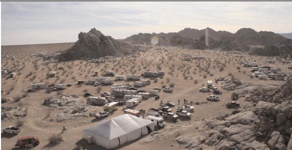
SAVE JOHNSON VALLEY RALLY DECEMBER 2008 - COUGAR BUTTES AREA

Using motorsports as a proving ground for more than 35 years, BFGoodrich® Tires is involved in every type of racing, including oval, sports car, drifting, drag, desert, dirt, rally, and extreme rock crawling. BFGoodrich Tires combines technological expertise with vast motorsports experience, delivering a high-performance tire for every type of vehicle. Visit BFGoodrich Tires online at www.BFGoodrichTires.com . In 2009, BFGoodrich Tires developed a gathering place for auto enthusiasts to celebrate the thrill of GO through an online community. Nation of GO is an online community where people with a passion for driving can celebrate and share what they love to do best at www.NationofGo.com