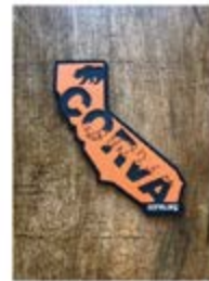
CORVA State Patch $4.00