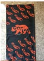
CORVA Neck Gaiter $10.00