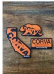
CORVA Patch Set - Bear, State, Logo $10.00 — Self Out