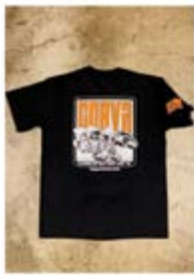
Men's Short Sleeve Graphic Shirt $28.00

Thank you for helping to support CORVA. Don't forget to order extras to give along with a Gift Membership for all those off-roaders in your family! If you have any suggested items that you might want that are not listed, send us an email . We are always looking to promote CORVA!