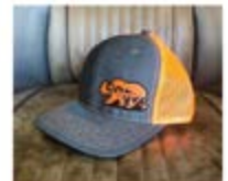
CORVA - The Public Lands Bear Mesh Hat - Orange $25.00