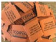
2 - CORVA Cookies $7.00