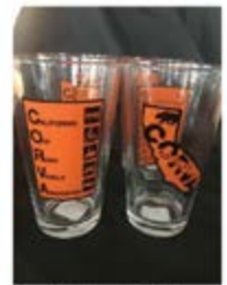
CORVA Glasses (Set of Two) $40.00