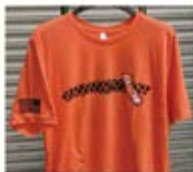
CORVA 50th Anniversary T-Shirt - Orange $12.00