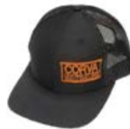
CORVA - Mesh Hat - Black $25.00