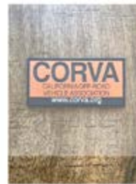
CORVA Logo Patch $5.00