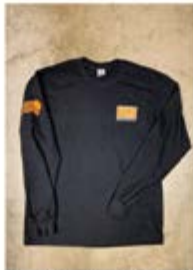
Men's Long Sleeve Graphic Shirt $30.00