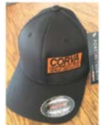
CORVA Flex Hat $25.00 — Self Out