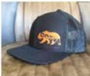
CORVA - The Public Lands Bear Mesh Hat - Black $25.00