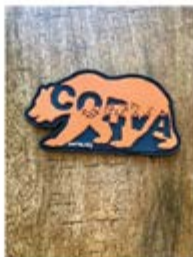
CORVA Bear Patch $3.00