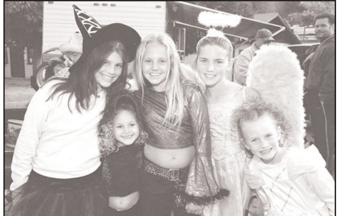
The Northern Jamboree is all about having a FUN time!

amy.granat@corva.org 800-42-CORVA ext. 503