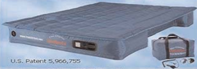
U.S. Patent 5,966,755