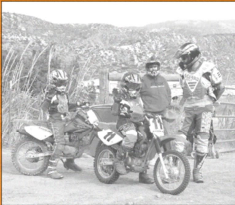
Bring the family & enjoy your many off-road games! Your attendance helps raise funds for CORVA!

Free 90 Day Membership to Prospective Members