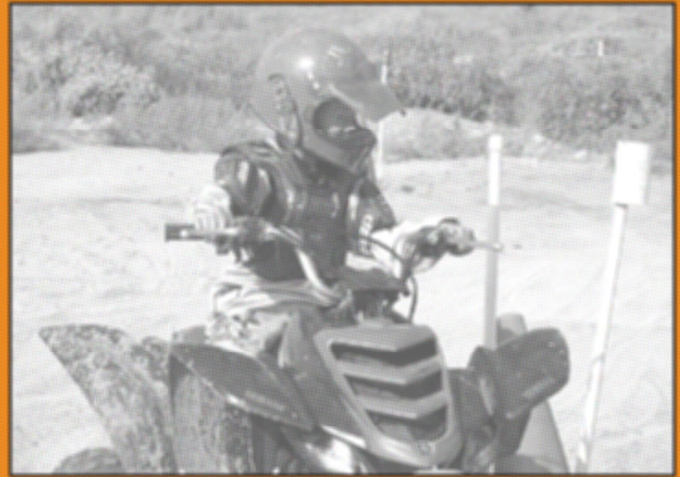
The Can Slame event is a fun race against the clock!