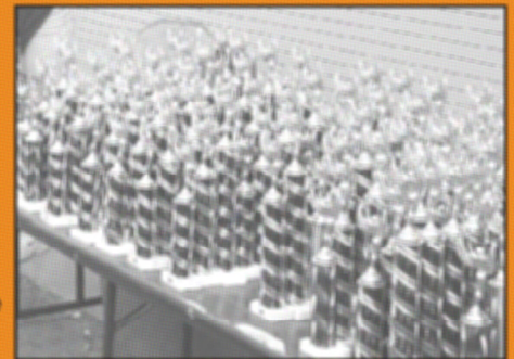
Trophies for all ages & skill levels! We make sure everyone gets a chance to win one!