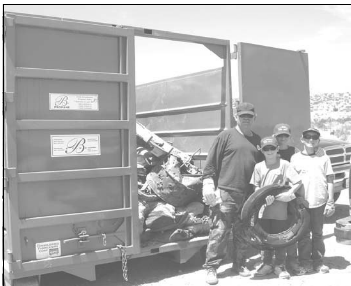
An off-roading father and his three children are all smiles as they transfer their collected debris to the overflowing dumpster.